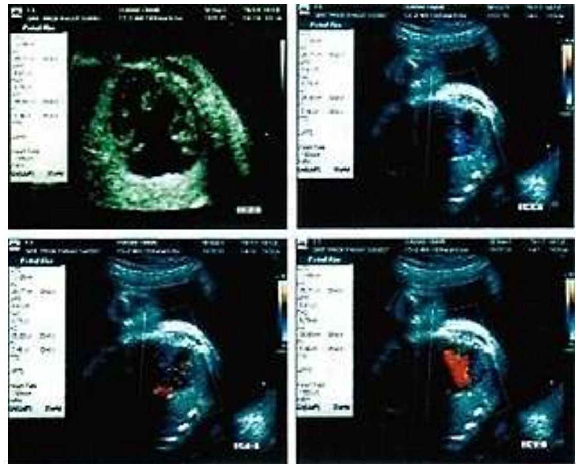
Figure 2.Ultrasound examination of the fetalcord using two-dimensional ultrasound (2D) and 2D power Doppler